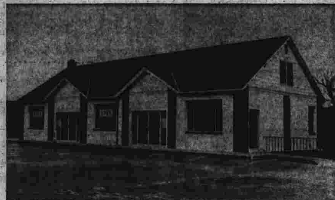
Pictured above is the exterior of the enlarged Shady Glen. 25 x 30 ft. addition was added to the right of the original building to bring it to the size seen here.

RE-OPENING SPECIAL * TOMORROW AND SUNDAY