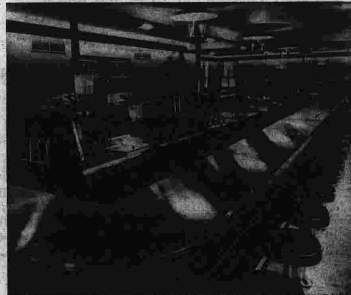
Above, an interior view of the new Shady Glen giving some idea of the additional space now available. In the right background is the bulk sales section.

We hope you'll like the change that has taken place at Shady Glen. It has all been done with YOU in mind. For some time—thanks to your splendid patronage—we have felt the need of additional space, especially for handling "Take Out" orders for Shady Glen Ice Cream.